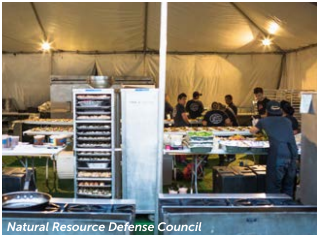
Natural Resource Defense Council