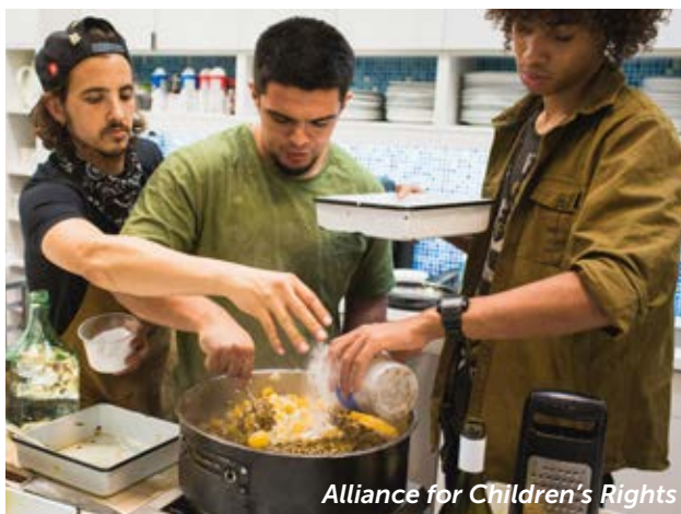
Alliance for Children's Rights