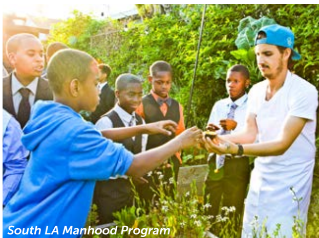
South LA Manhood Program