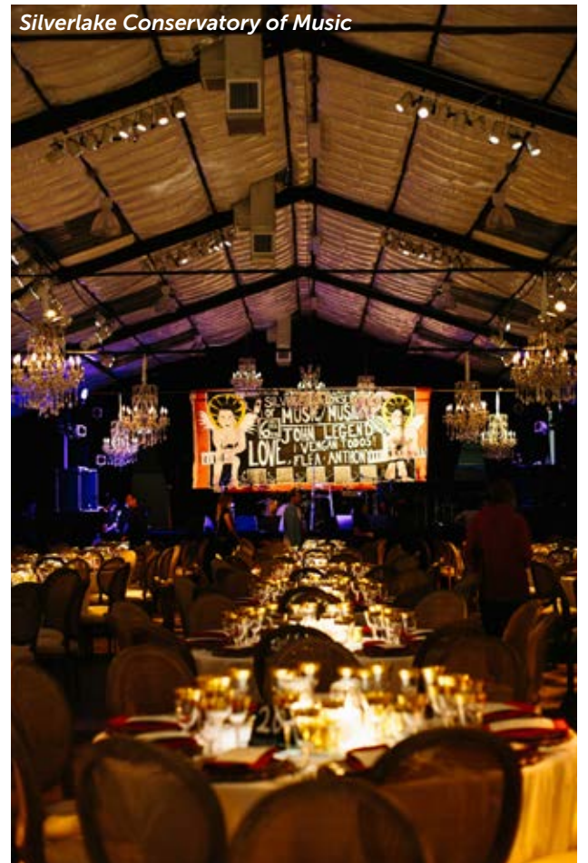
Silverlake Conservatory of Music