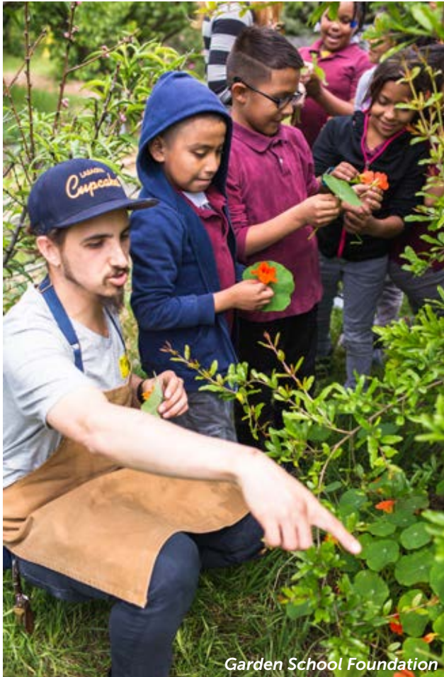
Garden School Foundation